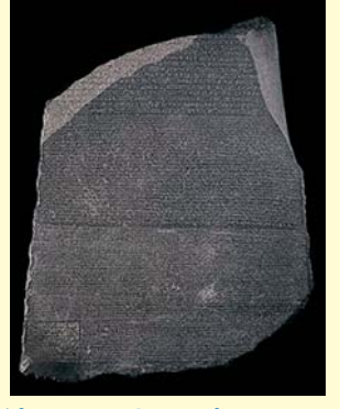
The Rosetta Stone – key to some ancient languages

Before 1947, the oldest known manuscript of the Old Testament, dated to no earlier than AD 935, and critics could claim that the text was unreliable after centuries of copying. Then the discovery of the Dead Sea Scrolls revealed portions of nearly all the Old Testament books dating to around 100 BC, over 1000 years older than what had