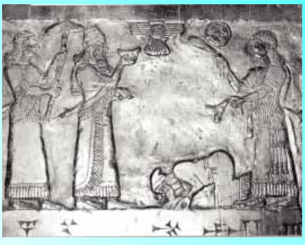
Fig.2 Section of the Black Obelisk of the Assyrian king Shalmanezer III, showing Jehu paying tribute. The obelisk is now in the British Museum

It's fascinating that we have mention of the use of just such a seal in the Bible's account of one of Jezebel's most wicked acts. Ahab her husband wished to acquire a vineyard next to another of his palaces at Jezreel in