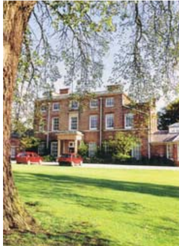
Darwin House, Shrewsbury, where Charles Darwin was born in 1809

Darwin was also much influenced by the writings of Thomas Malthus on the problems of increasing population in a world of finite resources. Malthus predicted that this would lead to wars and famine. Accordingly, Darwin’s views on “the survival of the fittest” allowed him to approve of colonial genocide, such as the deliberate wiping out of the aboriginal inhabitants of Tasmania by