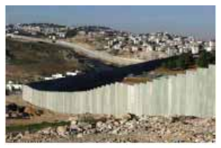
The picture shows a section of Israel's "antiterror" wall, built to deter terrorists

Our world is full of tensions. One major source of tension is the Arab – Jewish conflict. This very conflict was predicted in the Bible, which also predicts the solution.