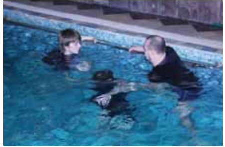
Belief and Baptism are the two ways in which we can become members of God’s family.

You are all sons of God through faith in Christ Jesus. For as many of you as were baptized into Christ have put on Christ. There is neither Jew nor Greek, there is neither slave nor free, there is