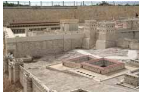
The Roman fortress of Antonia was just behind the Jerusalem Temple

Before they could take him back to the fortress for safekeeping, Paul asked if he might address the crowd, and after clarifying exactly who he was, Paul was allowed to stand on the steps leading into the barracks to address the mob. He spoke to them in Hebrew, which pacified them somewhat, and began by giving a little of his background.