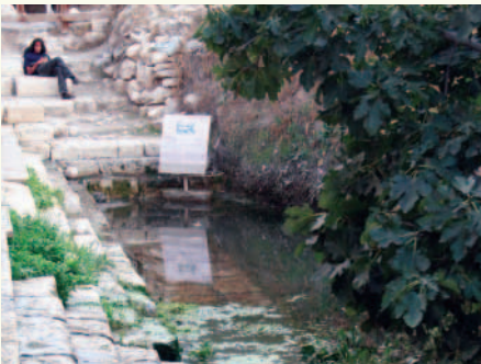
The newly-discovered Pool of Siloam, outlet of the Gihon in Jerusalem.

It is said that the Pison and Gihon rivers disappeared completely, but is this true? Did they dry up or go underground for centuries? This may be the fate of the Pison, but not the Gihon, mentioned several times in the Old Testament. The scriptures tell of King Hezekiah (741–726 BC) consulting his military officers about blocking up all the springs in the land to thwart the coming invasion by Sennacherib, the Assyrian, causing the 'upper Gihon' to flow westward to the City of David (2 Chronicles 32:30). Also King Solomon's anointing took place at Gihon, described as a 'spring in east Jerusalem', indicating a sign of life (1 Kings 1:38).