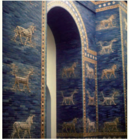
Reconstruction of the Ishtar Gate that once stood in Babylon.

'O Lord, You have spoken against this place to cut it off, so that none shall remain in it, neither man nor beast, but it shall be desolate forever.' Now it shall be, when you have finished