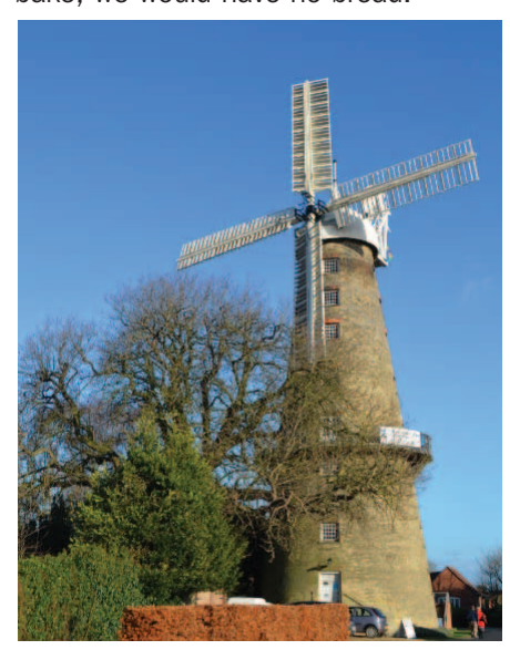
Moulton Mill, Lincolnshire.

Going back in time, which a visit to Moulton Mill helps to facilitate, we get to appreciate just how much work is still required to provide our food. The farmer, the miller, the baker and the shopkeeper all have to do their work well, so that we can eat. How easy it is to take things for granted when we only see the end product, and forget what's involved. And what is true about an everyday product is also true about what God provides. For unless He provides the right weather conditions to allow the grain to grow, the wind to turn the sails and gives the miller and the baker the energy to grind and bake, we would have no bread.