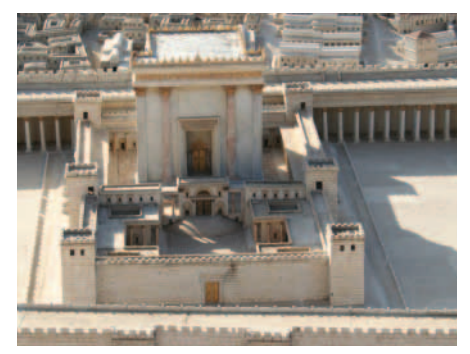
Model of the Jerusalem Temple, built by King Herod during the 1<sup>st</sup> century

These fascinating descriptions of the believers were foreshadowed in the literal temple which King Solomon built and they have profound implications for how 21st century followers of Jesus should conduct themselves. It was King David who originally desired to build a temple (or 'house') for God (see 2 Samuel, chapter 7). God sent Nathan the prophet to say that it had never been one of His requirements to have a house built for Him. Conversely, God said that He would build a house for David, meaning a dynasty of kings,