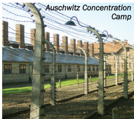
Auschwitz Concentration Camp

Both of these passages make it clear that the future of the Israelite nation was dependent on their obedience to the Law of God: something they had solemnly agreed to do. If they followed