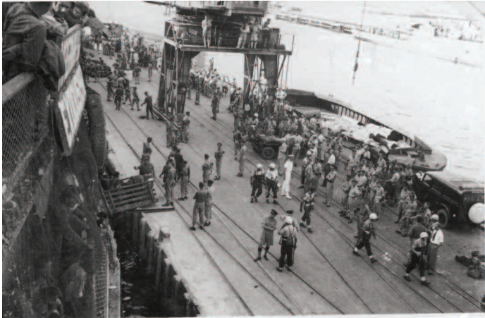
British soldiers prevent the disembarkation of Jewish refugees from the ship “The Exodus”

years after the Balfour Declaration). By a majority of 33 to 13, the UN voted in favour of partitioning the land into a Jewish territory and an Arab territory with Jerusalem as a UN-administered International City. At last the Jews were to have their own State. Britain finally withdrew from Palestine on 14th May 1948. So great was Britain’s desire to leave that they did not exit in an orderly fashion and did not hand the government of Palestine over to anyone!