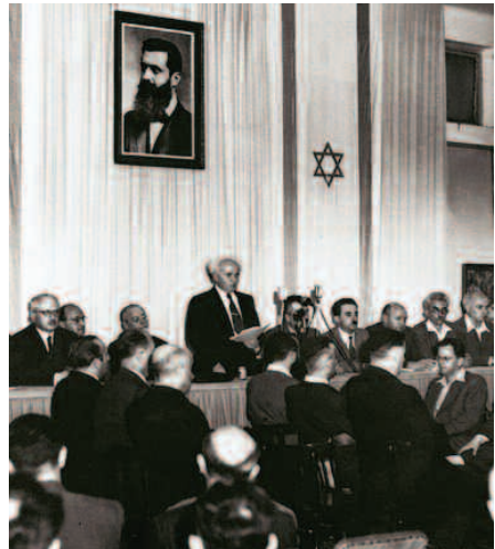
Declaration of the State of Israel by David Ben-Gurion, 14th May 1948